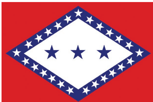
Original Arkansas State Flag

Although simple in appearance, the Arkansas state flag has always been rich in symbolism. ♦ —Heidi Hilbert