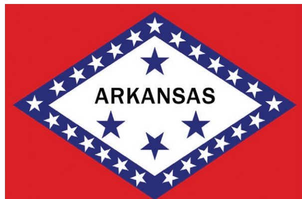
Official Arkansas State Flag