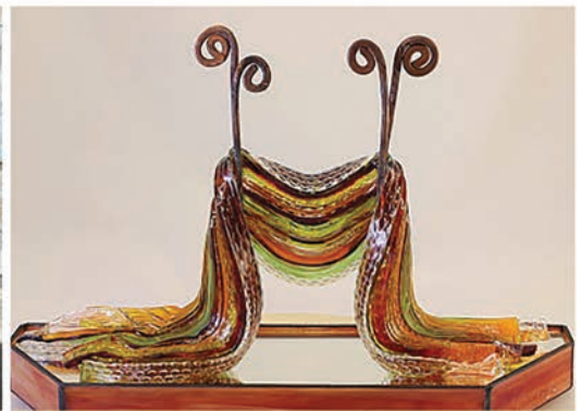
Heated stained glass is molded over two copper rods.