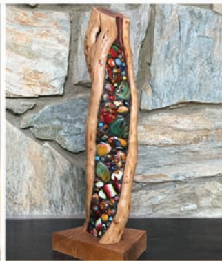
Hollowed-out wood is filled with stained-glass pieces.