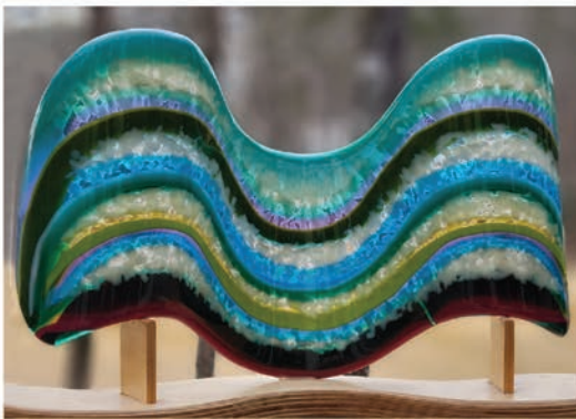
The “Wave” is created with heated and molded stained glass.