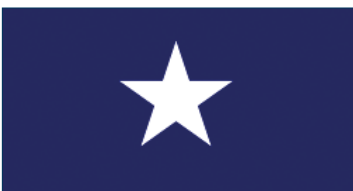
Bonnie Blue Flag