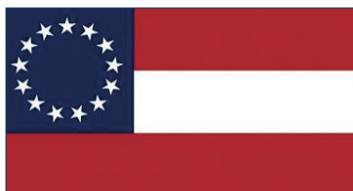
First National Flag