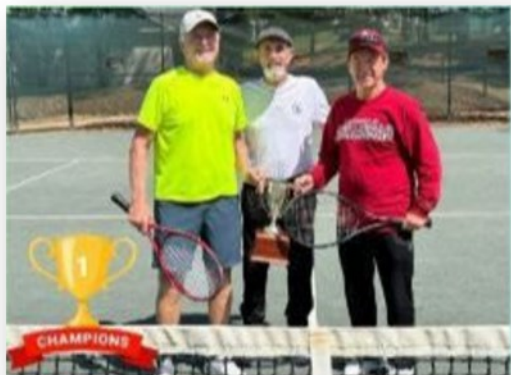
Congrats to the winners of the Men’s Tennis Championships.