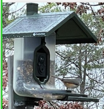
Camera & Feeder

This type of feeder can retail for as low as $50 on Amazon, many with free shipping. Below are some actual photos from the phone app. Enjoy your new-found sport—Birdwatching can be just as engaging as watching episodes of The White Lotus!