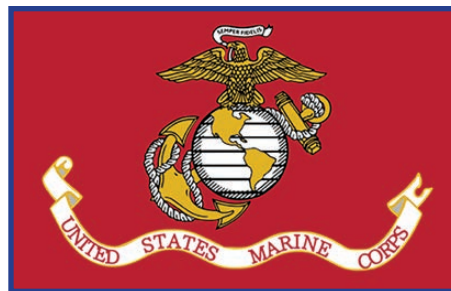
United States Marine Corps