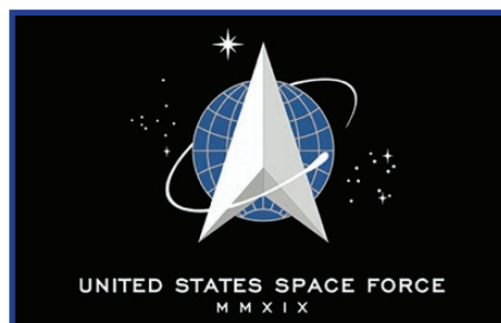
United States Space Force