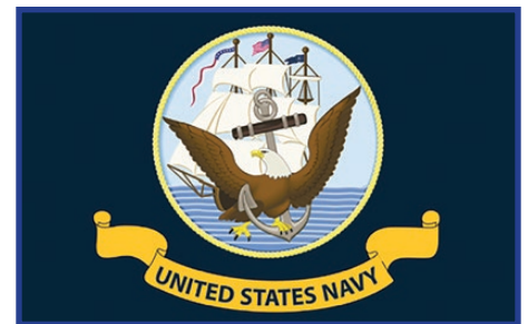
United States Navy