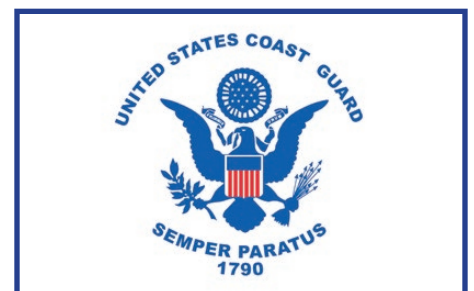
United States Coast Guard