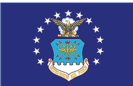
United States Air Force