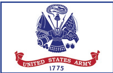
United States Army