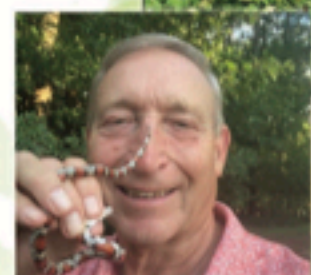
No...it's a nonpoisonous milk snake!