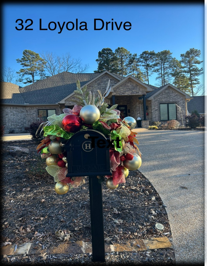
32 Loyola Drive