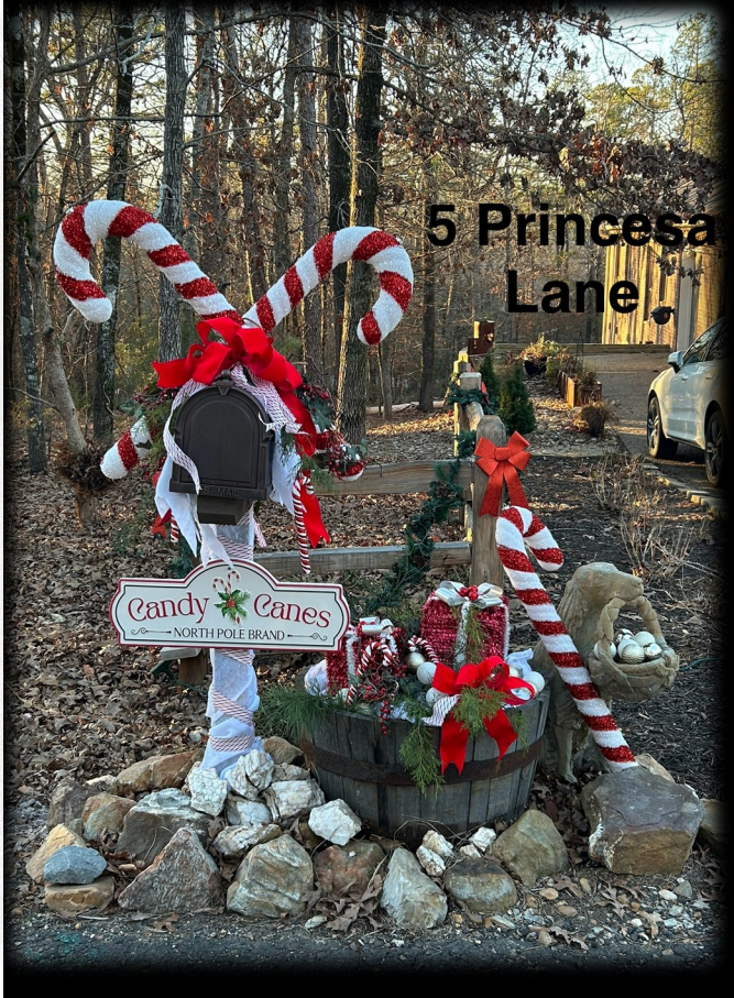
5 Princessa Lane