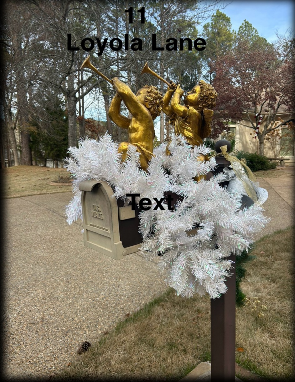
11 Loyola Lane