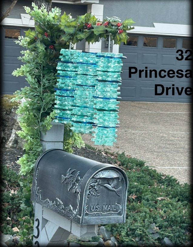
32 Princesa Drive