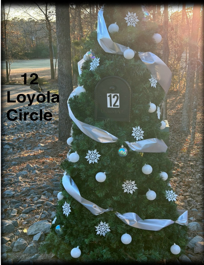
12 Loyola Circle