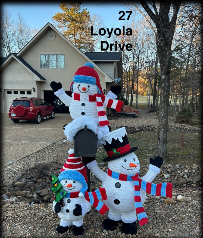
27 Loyola Drive