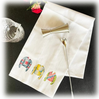
Jockey Silks II Hand Towel $18.00