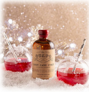
Candy Cane Syrup From $14.99