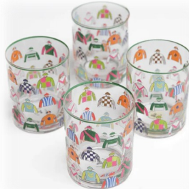
Racing Silks Bourbon Glasses | Set of 4 $72.00