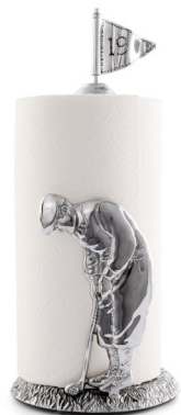
Golfer Paper Towel Holder $137.00

What home on the driving range or sand trap doesn't need one of these on their kitchen counter? Crafted by another favorite small business online, Vagabond House , this towel holder will be the talk of the next month's Bunko gathering. Get it: www.vagabondhouse.com